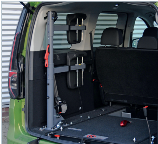
The FUTURESAFE can be swivelled to the side to save space when no wheelchair is being transported

Head and backrest - patented safety system for wheelchair occupants