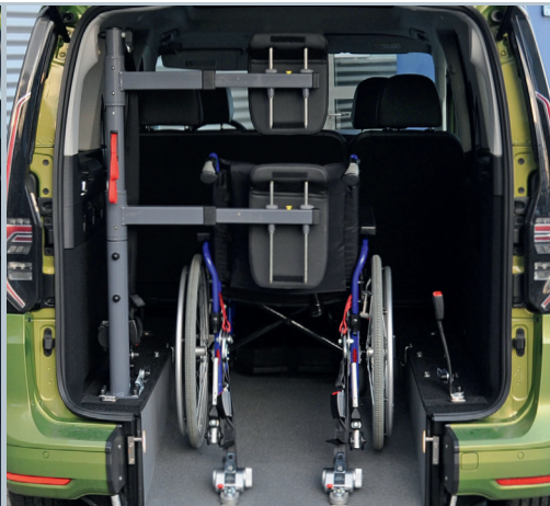
With the integrated shoulder belt and the PROTEKTOR occupant & wheelchair restraint system, the wheelchair user is fully secured.