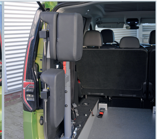
Additional cushions for head and backrest are optionally available to provide extra comfort during the ride.